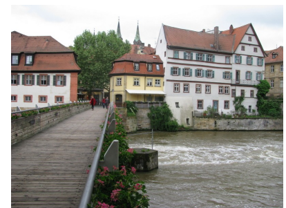
One of many beautiful views in the gorgeous town of Bamberg, Germany