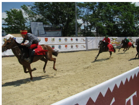
Horse races around Hero Square during a national festival