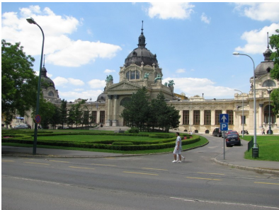
Szechenyi Spa in the centre of City Park, Budapest