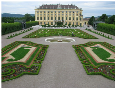
"Small" side garden at Schönbrunn Palace, Vienna