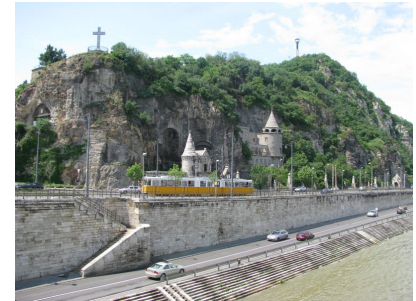
Gelért Hill near the Budapest University of Technology and Economics