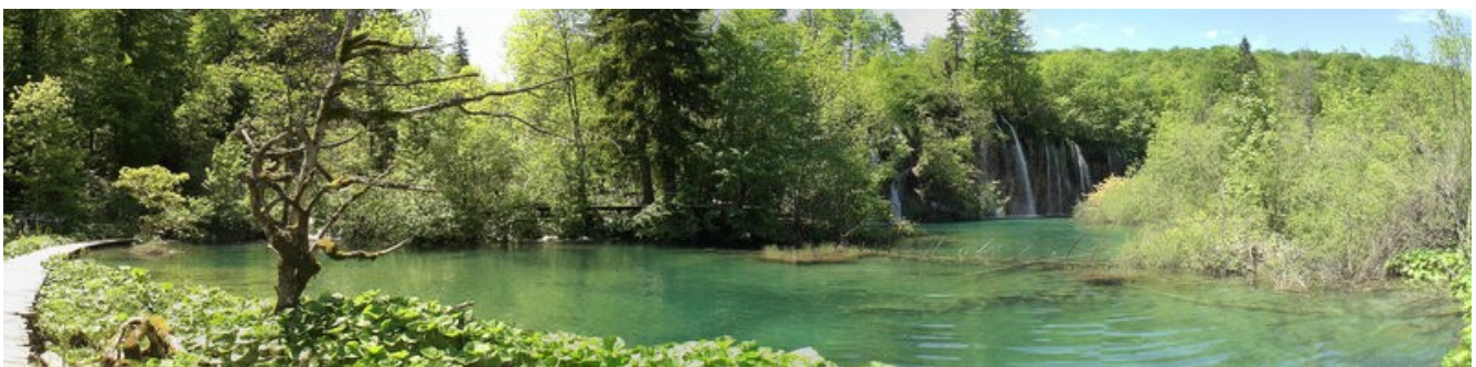
One of the many serene lakes in the picturesque Plitvice Lakes National Park, Croatia