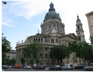
St. Steven's Basilica in the heart of Budapest