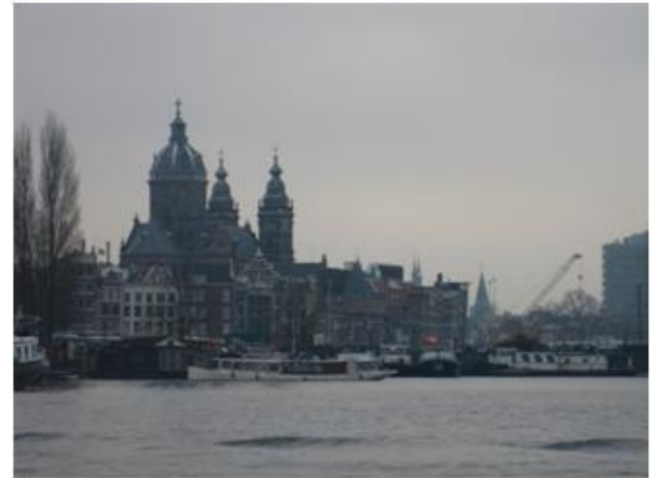
Vienna, Prague, Amsterdam

The Canada-EU Student Mobility Initiative allowed me to accomplish my dream of traveling through Europe. It has also afforded me a wider view of the world and allowed me to see and appreciate my own country in a new light. Overall, I would like to say it has been such an amazing, unique experience and I feel privileged to with the opportunity.