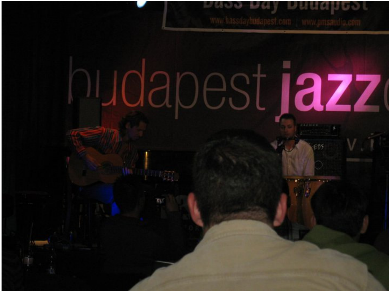
A jam session in Budapest Jazz Club

Upon my arrival, I started searching for a flat to rent. I was lucky enough to meet with an undergraduate student on campus who gave me a realtor business card. I rented my flat in Museum Utca which was only in two tram stops from university campus and was in a walking distance to the Budapest Jazz Club.