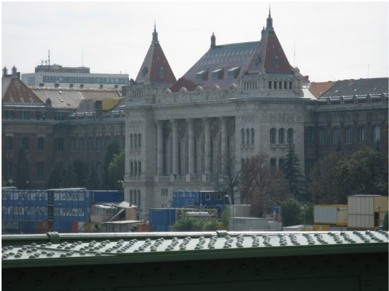
Budapest University of Technology and Economics