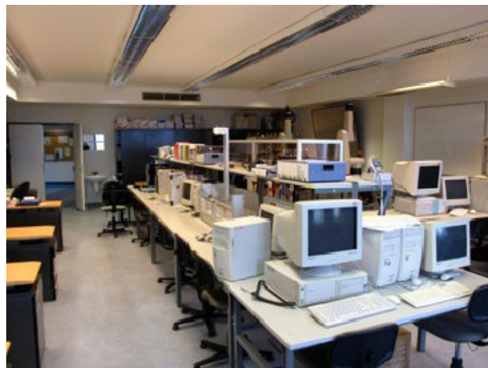
Intelligent Control Laboratory